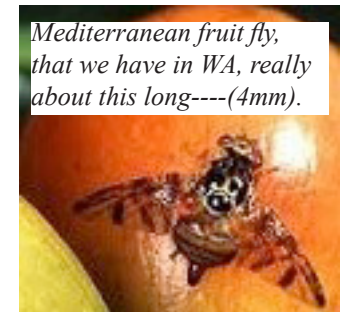
Mediterranean fruit fly, that we have in WA, really about this long----(4mm).