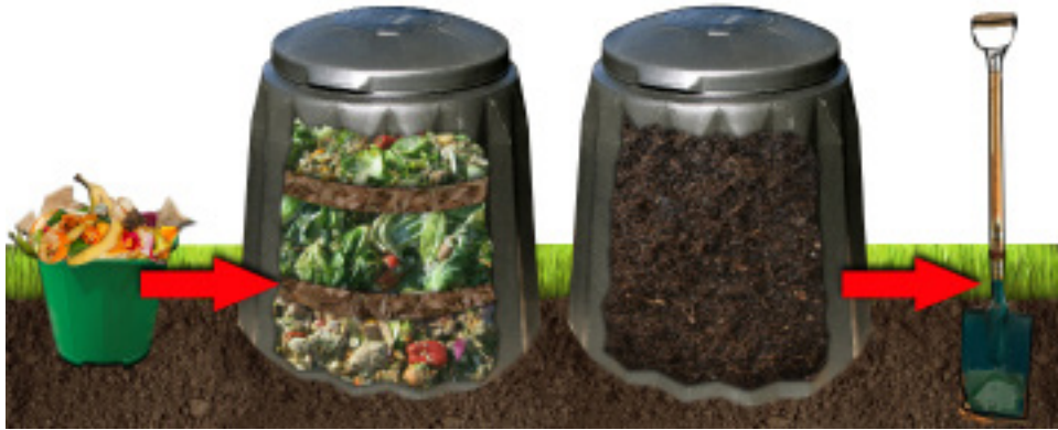
'X-ray' view of Twin Bins in action. Fill Bin 1. Leave it to mature. Start again in Bin 2. When Bin 2 is full, Bin 1 should be ready (or nearly ready) to use in your garden.

Follow this COMPOST RECIPE and you will: